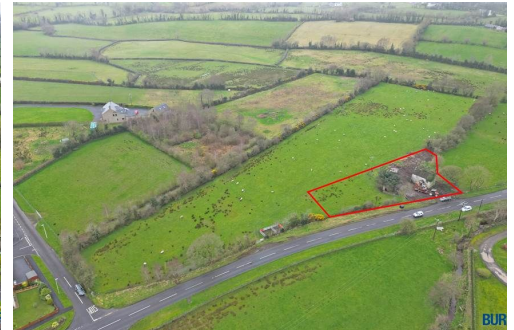
Building Site at 64 Lisnamuck Road, Maghera

Approximate Gross Internal Area = 195.4 sq m / 2103 sq ft